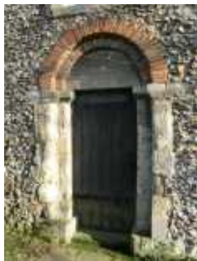
Wendens Ambo Church doorway with Roman bricks

After almost 2,000 years, there is still considerable evidence of Roman occupation of this area. It was not until their arrival in 43 AD that a national network of all-weather roads was built. The first were constructed between the capital, London, and bases used by the Roman legions. The network was maintained and extended through almost 400 years of Roman occupation. Main highways were either gravel or paved with stone. They were so well constructed that they could be used in all weathers.