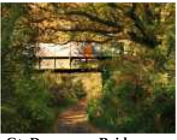
Gt. Dunmow - Bridge over the Flitch Way link path