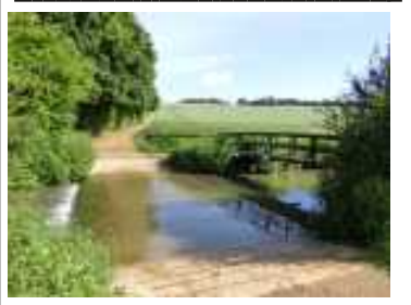
Thundridge - Ford & bridge over River Rib