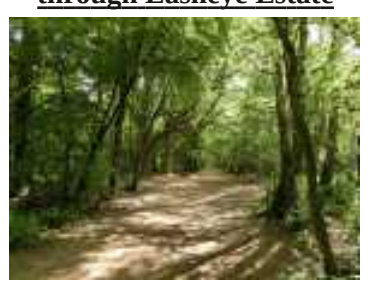
Elsenham - Alsa Wood