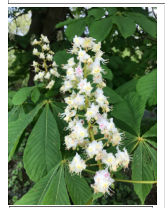
Horse chestnut flowers

This puppet was collected in 1840 and represents Hanuman, the Hindu god, who is half human and half monkey. Hanuman possesses great strength, and he plays an important role in the Ramayana helping legendary Prince Rama rescue his wife Sita from the demon King Ravana.