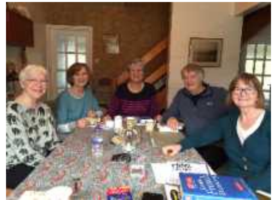
Stansted U3A French Group