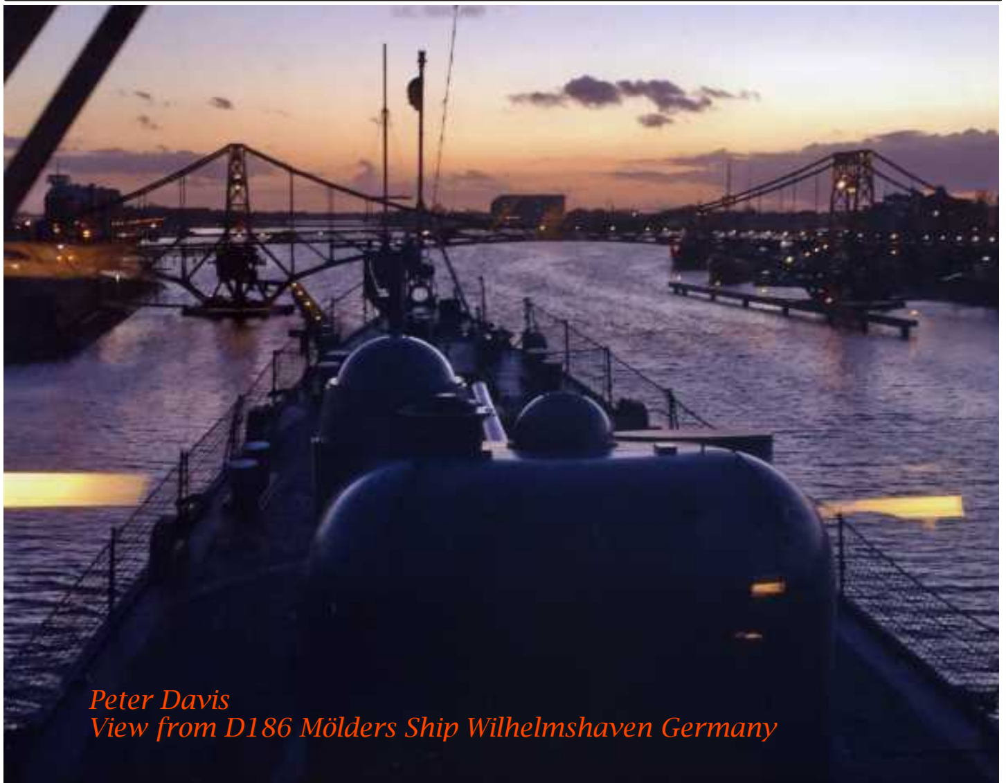
View from D186 Mölders Ship Wilhelmshaven Germany