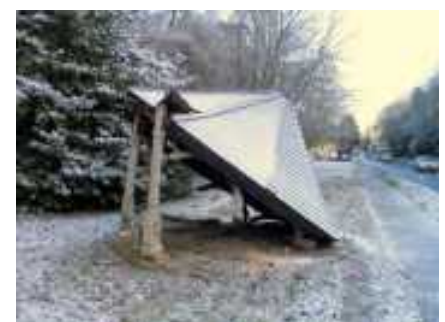
The fountain in its damaged state.