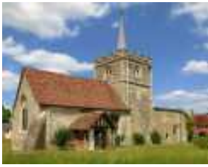
St John's Church, Duxford