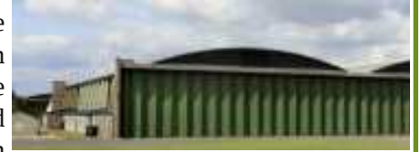
1917 aircraft hangar at IWM Duxford