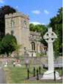
St Peter's Church and war memorial, Duxford

If you would like to explore this attractive village, please consider following Hundred Parishes Walk number 14 which can be downloaded from the Walks section of our website, www.hundredparishes.org.uk . The 5-mile route starts at Great Chesterford Station and passes through Ickleton, Hinxton and Duxford before finishing at Whittlesford Station. Until last month, I was under the impression that Whittlesford Station was in the parish of Duxford, but our guide informed us that the parish boundary was changed in 2010. Whittlesford parish, which lies outside the Hundred Parishes, also acquired the ancient Duxford Chapel. Duxford parish has retained most of its treasures including Imperial War Museum Duxford.