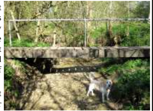
We used to have kingfishers in Newport.

It's not just houses. There is the Stansted airport expansion, with about another 10 million more passengers per year, consuming roughly 28 litres per passenger. The airport application (UTT/18/0460/FUL if you wish to comment on it) gives the figures below: