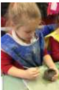
Acorn Class Bear Hunt and Lamp-making