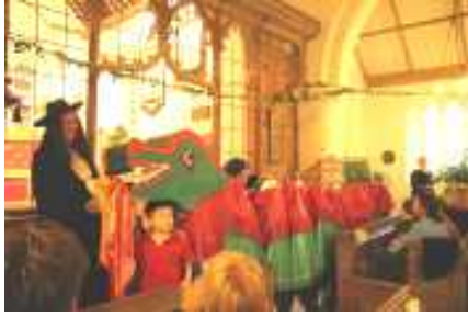
...at the Winstanley Day...