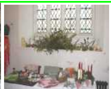
Decorations and sales stalls