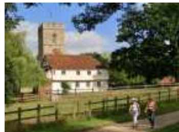
Walk around Matching

Willow stub or a pollarded Ash or Elm describe specific trees marking ancient boundaries, while place names such as Ford End in Great Waltham parish, Porridge Hall in Lindsell and Poor Bridge in Clavering intrigue.