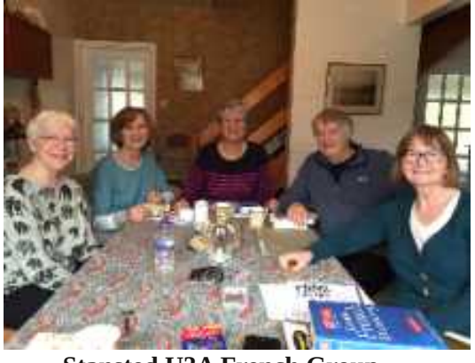
Stansted U3A French Group

Please visit our website, see below, or pick up an activity leaflet, and you could soon be enjoying a class as much as our new French Group.