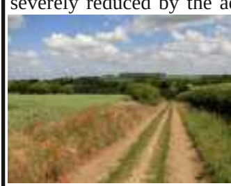
Looking towards Linton

there is normally space to park. The routes have been chosen for their attractiveness and level of interest,