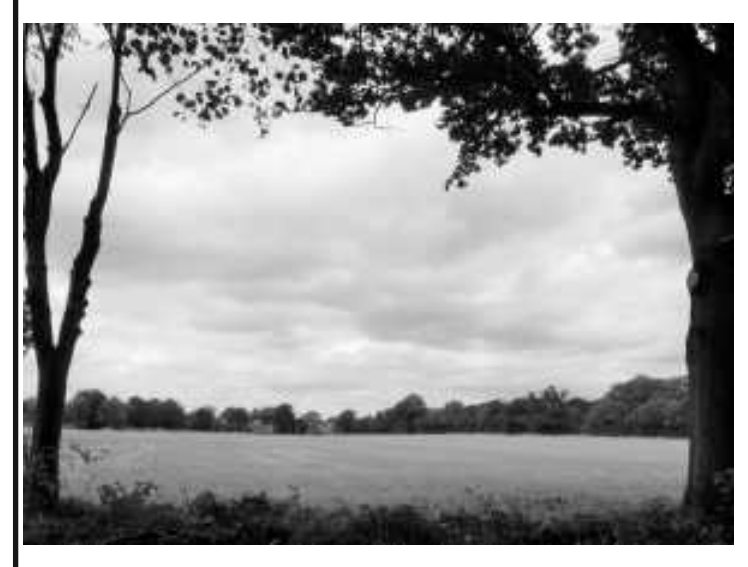
The development of this site would extend development into the countryside and be of an inappropriate scale to the village. The site is therefore considered unsuitable as development on the site would not contribute to sustainable patterns of development.

Land north east of Belchamp's Lane, Quendon, 6.35ha, 143 to 238 houses