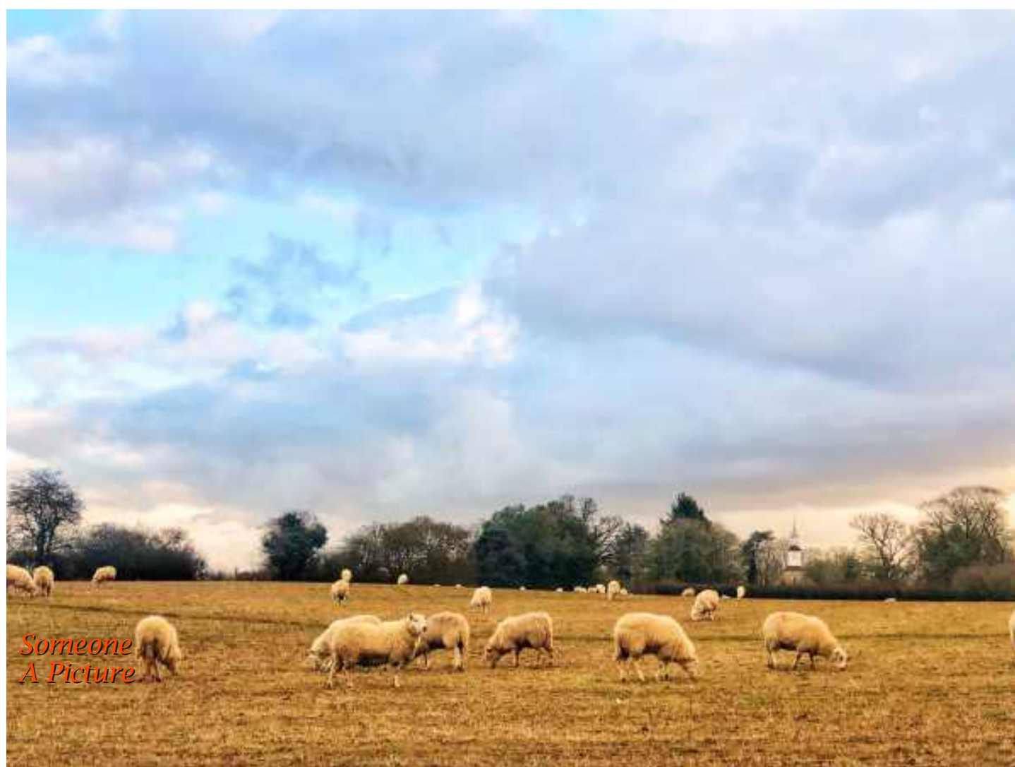
Someone A Picture