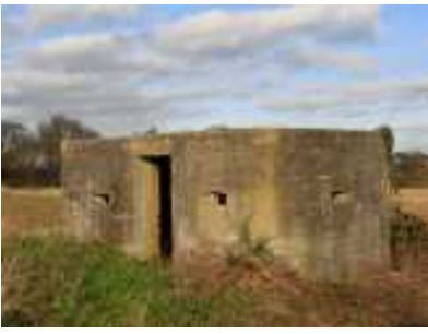
stretching In Great Waltham near Littley Green

Within the Hundred Parishes about 45 were built, mainly as part of line between Chelmsford and Cambridge, often