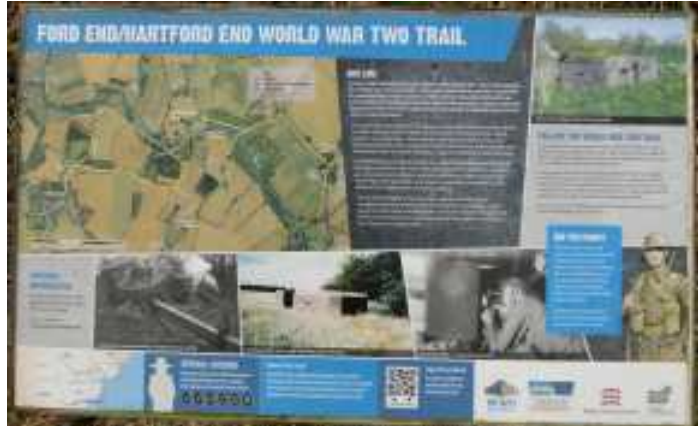
WWII trail at Great Waltham - interpretation panel at GR687169, S of Hartford End

The pillboxes were virtually obsolete as soon as they were built, being designed for an invasion that never came.