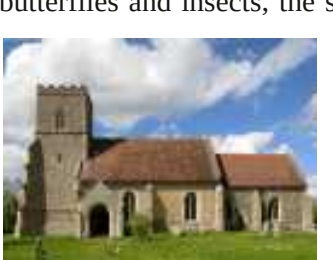
Walk 153 Castle Camps

While we can plan the route to pass through attractive countryside and villages, we can't predict what pleasures nature may have in store: perhaps majestic cloud formations, the sights and sounds of birds, the variety of