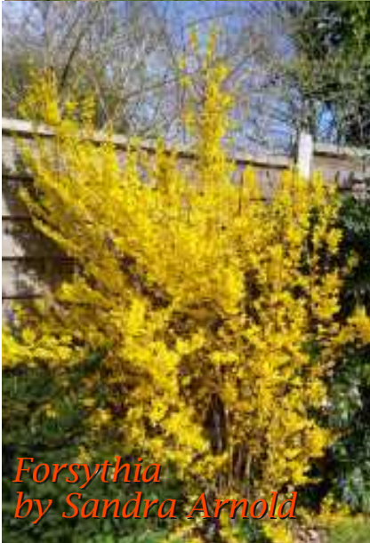
Forsythia

Send your pictures for inclusion in The Link to robert@arnold-q.uk