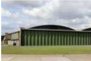
Duxford WWI Hangar

Duxford airfield, now the site of Imperial War Museum, Duxford, first became operational in World War I. Some of its buildings, constructed by German