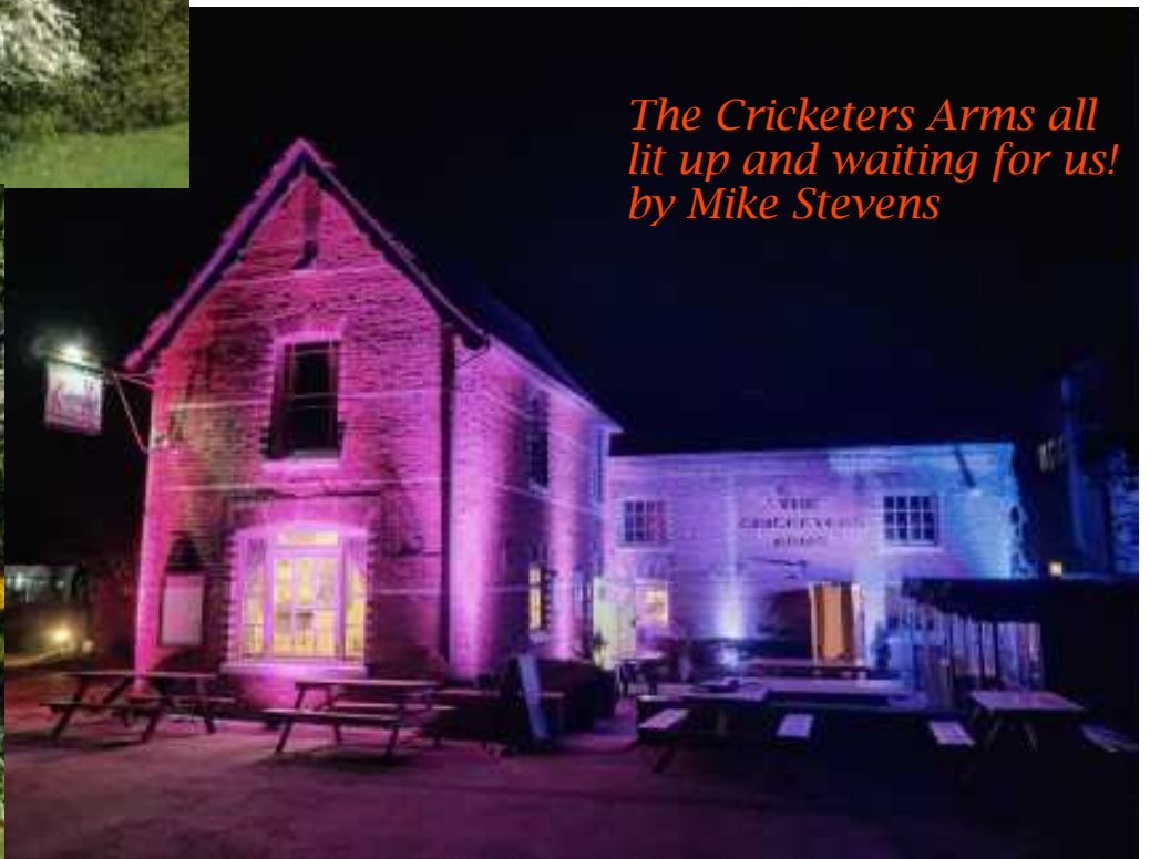
The Cricketers Arms all lit up and waiting for us!