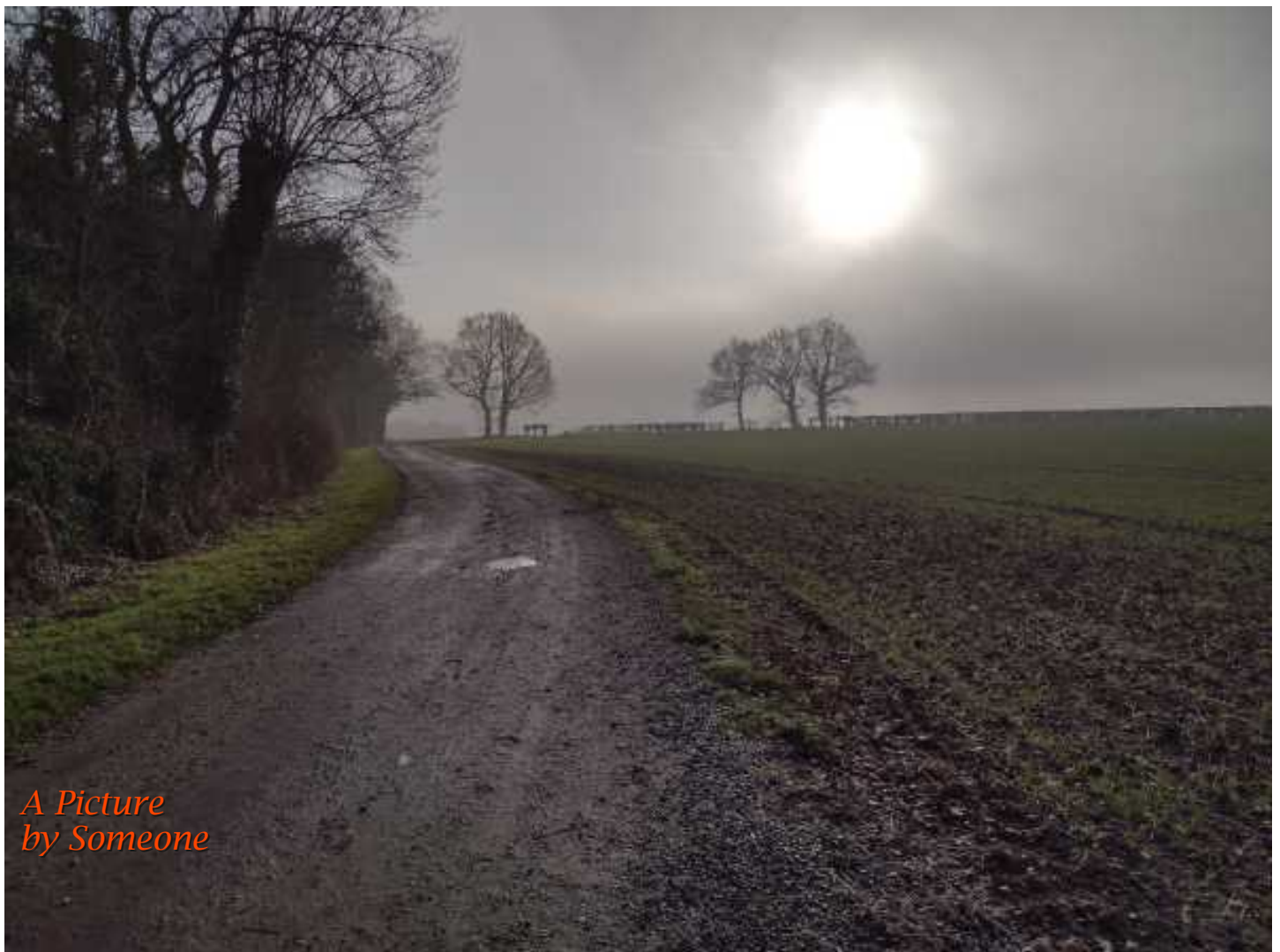
A Picture by Someone