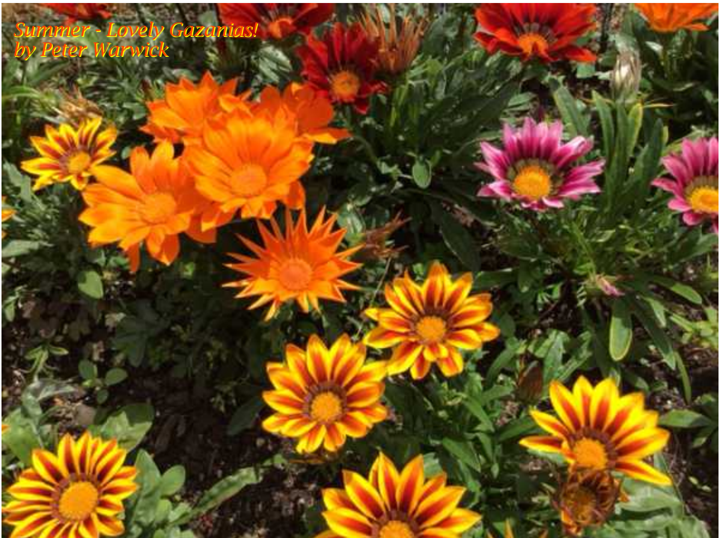
Summer - Lovely Gazanias!