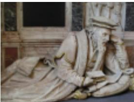
Richard Rich Memorial

Felsted School was founded in 1564 by Richard Rich, the first Baron Rich. Under Henry VIII, he accumulated immense wealth whilst overseeing the dissolution of the monasteries, and he was later appointed Lord Chancellor of England under King Edward VI.