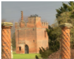
Rye House Gatehouse