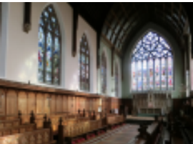
St Edmunds College Chapel

St Edmunds College in Standon parish is the oldest Catholic college in England. The main building dates from 1769. The school chapel is Grade I listed, built in the mid-19th century and designed by A.W.N. Pugin whose best-known work is "Big Ben", the clock tower of the Houses of Parliament.