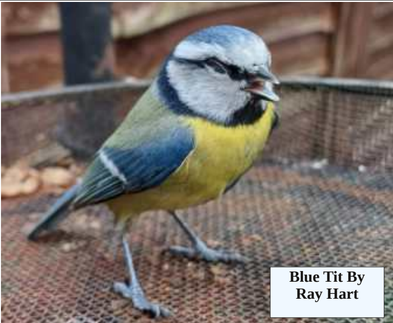
Blue Tit