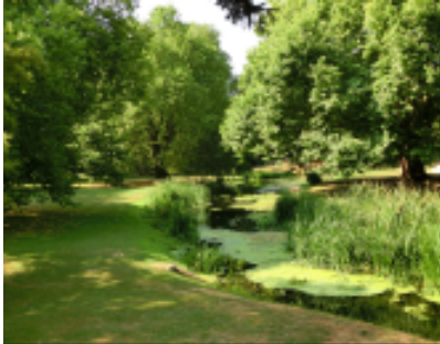
Audley End House garden

and flowers - some native, others introduced - providing havens for assorted wildlife. Gardens associated with such older properties will have been tended by many generations of residents, evolving over time as owners were influenced by fashionable trends.