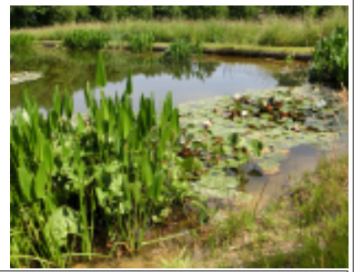
Pond in open garden