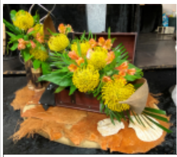
Pirates of The Caribbean