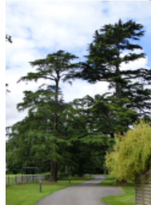
Cedar Tree Hargrave House - Stansted

From the mid-17th century onwards, non-native tree species began to appear such as Cedars and Horse Chestnuts, these being planted initially within the estates of trend-setting wealthy landowners. By the mid-19th century, gardeners were able to source an increasing number of exotic species as diligent plant hunters discovered them in various parts of the globe and the precious seeds or small saplings were grown on in nurseries and then released for sale.