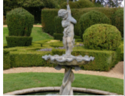
Bridge Gardens - Saffron Walden

Many of the listed buildings within the Hundred Parishes are surrounded by a private garden which enhances their setting, reinforcing their sense of place. They support a great variety of trees, shrubs