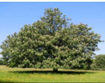
Horse Chestnut Steeple Bumpsted

Initially, they were stocked with native trees and shrubs, selected for their ability to provide fuel, timber, fence posts or fruits, while vegetables helped feed the family.