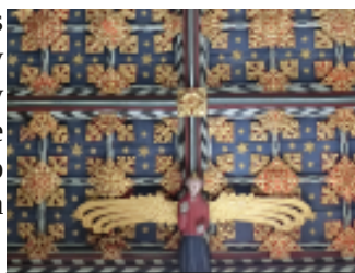
Braughing - church ceiling

Although the Society is not a religious organisation, we encourage visits to parish churches as they are often the oldest and most interesting building in any community. Inside, you may find images of angels in some form or another. These winged creatures are considered to be messengers of God. They also represent goodness, with a promise of heaven if you live a good life.