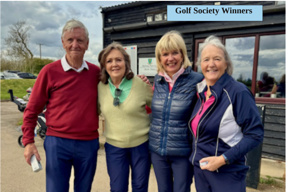
Golf Society Winners