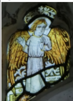
Clavering medieval glass

Angels in churches are depicted in paintings, on stained-glass windows, suspended from ceilings, carved into corbels that support roof timbers or on poppyheads at the end of pews.