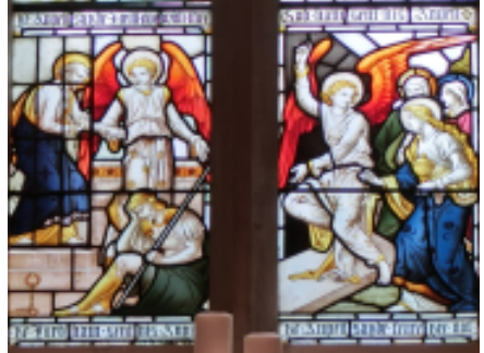
Radwinter Stained Glass