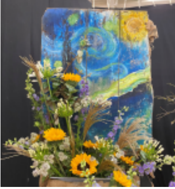
Jo Purdy design

England Area Day in Mildenhall on Saturday 25th April. In the morning we were