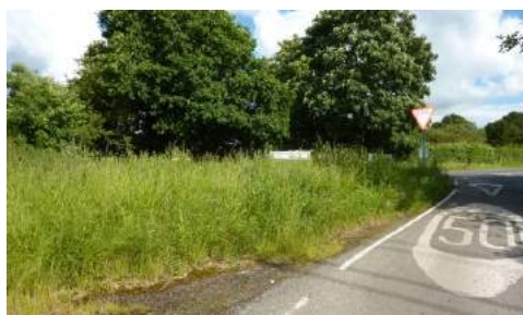
Junction of Belcham's Lane with the B1383.