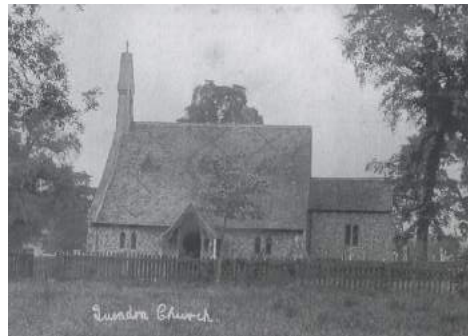
Quendon Church, 1909.

The Church of All Saints, Rickling, dates back to the 13 th century and probably stands on a pre-Conquest site. Later 14 th century additions include the first two stages of the west tower, the third stage dating back to the 16 th century. The Church of St Simon & St Jude, Quendon, is also a 13 th century building. It was altered in the 16 th century and further restoration and building work was carried out in 1861. The tower was hit by a lightning strike in 1941 and was later pulled down. It was replaced by the current tower and three bells in 1963. Details of other listed buildings in the village can be found on the British Listed Buildings website 1 .