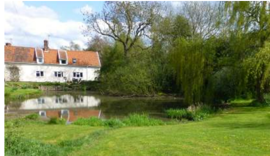
Dell Pond, Rickling Green, 2015.

An interest was also shown in future environmental projects; ideas such as the restoration and development of local ponds, a woodland trail and bulb planting were well supported. Better allotment facilities also attracted some interest and in Question 10, people were asked if they would be willing to help with these initiatives. The results show that there is both an interest in, and a will to engage with the local environment and this enthusiasm should be encouraged and used for the benefit of the village as a whole.