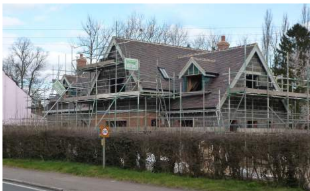
Two developments along the Cambridge Road, 2015

278 residents answered question 29, of which 56% felt that there is sufficient publicity given to planning applications in Quendon & Rickling. Further questions went on to determine the number and type of development that people would like to see in the village. Question 33 asked where new developments should be sited. Of the 170 respondents to this question, 99% would like them to be within the village boundaries. 95% also considered infill plots as suitable sites for development.