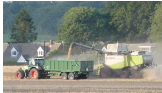
Harvesting in the 21 st century

In 2011, the population of Quendon and Rickling was recorded as 587, which shows a gradual increase of just 60 since the 1901 Census. However, the lives of the residents have changed in many ways. New skills in technology, trade and commerce are listed under ‘Occupation’, and very few of the residents now work in the village. Although surrounded by farmland, modern farming techniques and practices negate the need for a large local workforce. We have lost most of the trades and services enjoyed by past residents, but hopefully we have not lost their spirit and sense of community. Our village has evolved over centuries and will continue to do so. The Village Plan is our opportunity to contribute to its future.