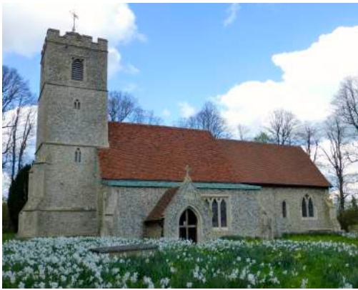
All Saints Church, Rickling, 2015

As long standing institutions within our community, the questions in this section sought residents' views on the Church and local schools. 73% of respondents value the part the Church plays in village life, a further 64% being aware of the role of the Friends of Rickling & Quendon Churches. Rickling School is also a valued part of our community with 97% of the respondents confirming this.