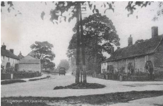
Junction of what is now, Rickling Green Road and Cambridge Road.

The 1870s saw the beginning of the decline in agriculture. The village population had increased to 708, with new trades and professions appearing on the census, but farming was still the main employment, with 129 men listed as agricultural labourers. By 1901, a population of 527 reflected the general move away from the land to the towns and cities. The agricultural workforce now totalled just 37, with 5 stock-keepers and a cowman listed. By the beginning of the 20th century, the village had witnessed some radical changes in society. Records show the population as 534 in 1931, rising slightly to 557 in 1951. Although still a rural community, the majority of the workforce no longer worked on the land.