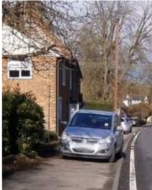
Pavement obstructed along Cambridge Road, Quendon.