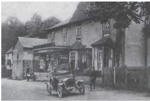
Mumford Stores, 1920s.