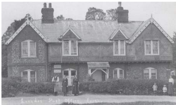
Old Post Office, c.1906.

Quendon windmill would have been a prominent local landmark. First mentioned in 1678, the original Post Windmill was blown down in 1795 and replaced by a Tower Windmill in 1805. This in turn was demolished c1900.