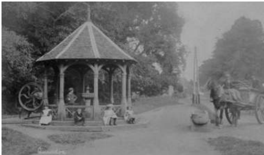
The Pump at the beginning of the 20th century.

Another familiar building is the Village Hall, which began life as a Reading and Coffee Room. A 'Grand Bazaar' was held in the grounds of Quendon Hall to raise funds for its construction. 10 Later that year a 'Fancy Bazaar' was held to raise funds for the building of the Parish Room. The curate of Rickling believed this 'would be a boon to inhabitants' and could also be used for religious and other purposes. 11