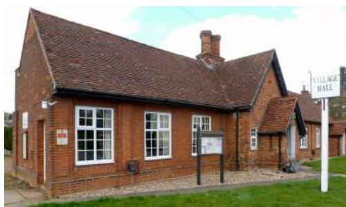
The Village Hall, 2015.