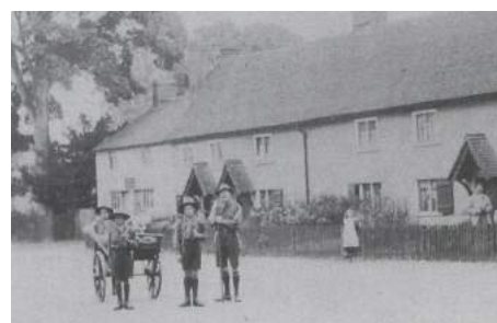
Boy Scouts and Scout Master in Rickling, 1915.

In the early 20 th century, a variety of clubs could be found in the village. A Mothers' Union, Women's Institute, Men's Society and Scouts held regular meetings, with a Horticulture Society and Flower Club catering for gardening enthusiasts. In the early 1900s a Coal Club and Shoe Club were set up, a weekly membership acting as a savings scheme for people. Sports clubs were also popular. In 1883, the village had an Archery and Tennis club, and the Tennis Club was