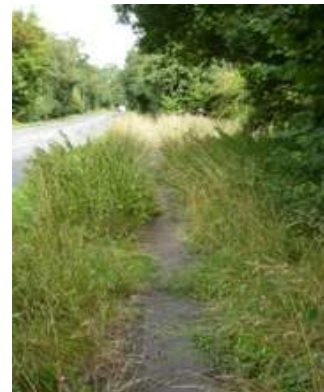
Pavement along B1383

Both this and The Environment section raised the issue of the condition and maintenance of pavements around the village. It is generally felt that they are in a fair state of repair within the core of the village, but this rapidly deteriorates as you travel towards Newport and Stansted. Encroachment of vegetation at ground level from poorly maintained hedgerows and verges restricts access for pedestrians, often making passage more or less impossible.