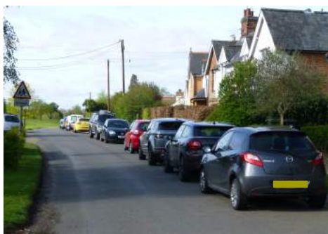
Parking along Rickling Green Road

This section also looked into the role the airport plays in the life of the village as both a transport hub and employer. Although the airport has a high profile in the area, it employs very few residents and plays a small role as a transport hub for commuters. Most journeys made from the airport are for leisure, a few people travelling several times each year, but less frequently for the majority of travellers.