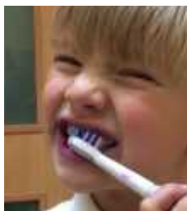
Beech Class's purple teeth!