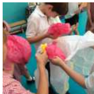
Learning about digestion