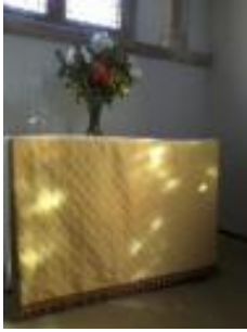
Rickling Church Altar Frontal

Grass cutting will begin after the late spring Bank Holiday so please excuse the meadow like appearance until then.