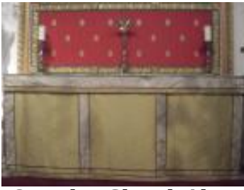
Quendon Church Altar Frontal

The Altar frontals are changed throughout the year according to the Church festivals, i.e. Lent, Easter, Christmas etc. The Gold frontal at Quendon Church had become very thin and tattered. Thanks to a small group of women who meet occasionally to sew, new fabric was bought and with careful work a replacement was made. With the small amount of fabric left, they went on to make a new frontal for the small altar at Rickling Church, replacing the original, sad and worn out one, which has needed attention for years.